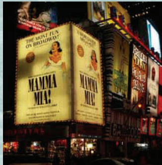
Our 2010 -2011 Recital theme is "On Broadway"

Watch week will be the first Monday of every month through the Saturday for classes in the purple room. October 4-9 will be the 1st watch week. Purple room classes will switch with yellow & you may watch through the view window.